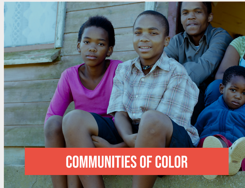
COMMUNITIES OF COLOR

40% of Houston's apartments were built between 1960 and 1979 when building safety regulations were especially lax. As of 2014, approximately 400,000 Houstonians (more than 20% of the city's population) lived in these older apartments.