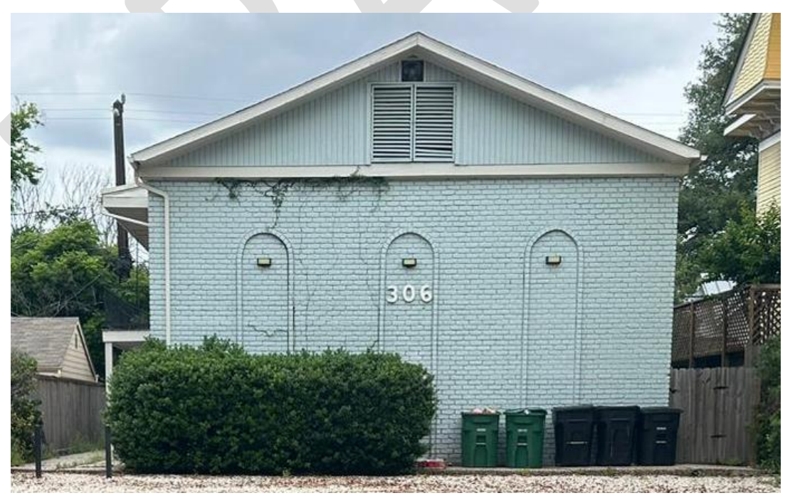
Brick appears to have been painted after May 2011 and before April 2015