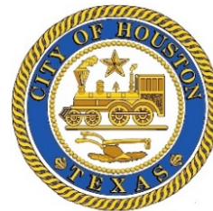
Mayor Sylvester Turner