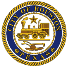
Mayor Sylvester Turner

For more information on Mayor's Office of Special Events visit: http://www.houstontx.gov/specialevents/