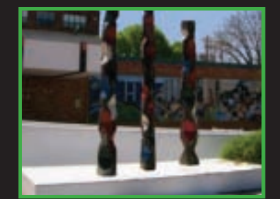
8. Fonde Totem Poles Untitled; artist unknown