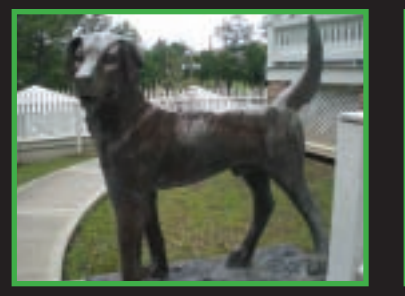
11. Pillot Dogs Richardson/Del Rey Bronze, Inc. - 1870/1989