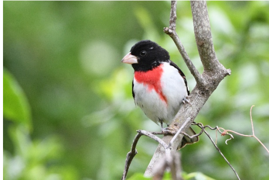
Rose-breasted Grosbeak: Cullen Ondracek

Species: Along the bayou, you can spot Great Blue Heron, Belted Kingfisher, and Green Heron. In the spring and fall, look for Rose-breasted Grosbeak, Blackburnian Warbler, Black-and-white Warbler, and Baltimore Oriole.