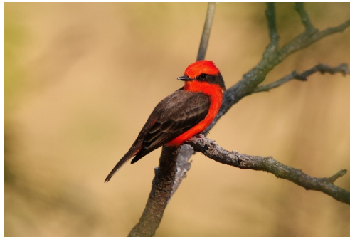
Vermillion Flycatcher: Cullen Ondracek

Species: Many sparrows in the winter including Lincoln's Sparrow, Swamp Sparrow, and Song Sparrow. Birds of prey hunting over the prairie area include Northern Harrier, Mississippi Kite, and Red Shouldered Hawk. Good diversity of flycatchers including Vermillion Flycatcher, Scissor-tailed Flycatcher, and Great Crested Flycatcher.