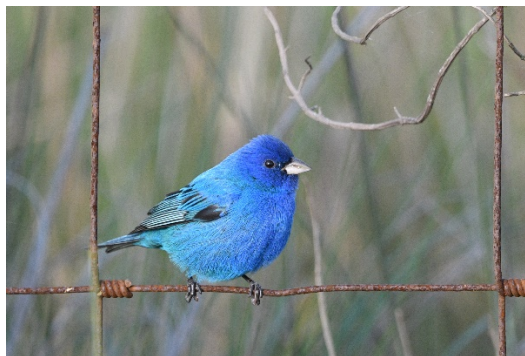
Indigo Bunting: Cullen Ondracek

Species: A large variety of warblers are seen at this park during spring migration, including Black-and-white Warbler, Wilson's Warbler, Northern Parula, American Redstart, and Yellow Warbler. Other birds seen at this park include Indigo Bunting, Brown Thrasher, Orchard Oriole, and Blue Grosbeak.