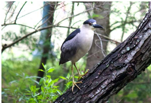
Black-crowned night heron

Species: Birds in the bayou and wetland area include Black-crowned Night-heron, Spotted Sandpiper, Green Heron, and Purple Martin. This park is a good place to spot non-native birds including Red-vented Bulbul, Scaly-breasted Munia, and Monk Parakeet.