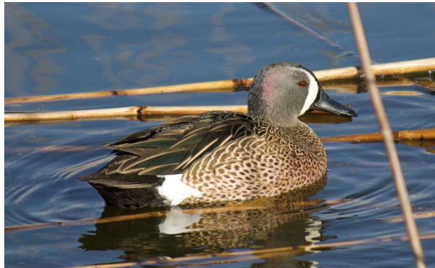
Blue-winged Teal: Cassidy Kempf

Species: In the pond, ducks such as Fulvous Whistling-Duck, Wood Duck, Cinnamon Teal, Blue-winged Teal, and Redhead can be spotted in the winter. Downy and Red-bellied woodpeckers are quite common throughout the park.