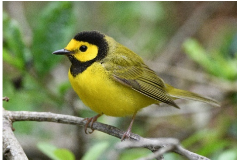
Hooded Warbler: Cullen Ondracek

Species: Open area around the nature center attracts Ruby-throated Hummingbirds, Eastern Bluebirds, and Red Headed Woodpeckers. Other species found at this park include Yellow-billed Cuckoo, Red-eyed Vireo, and Hooded Warbler.