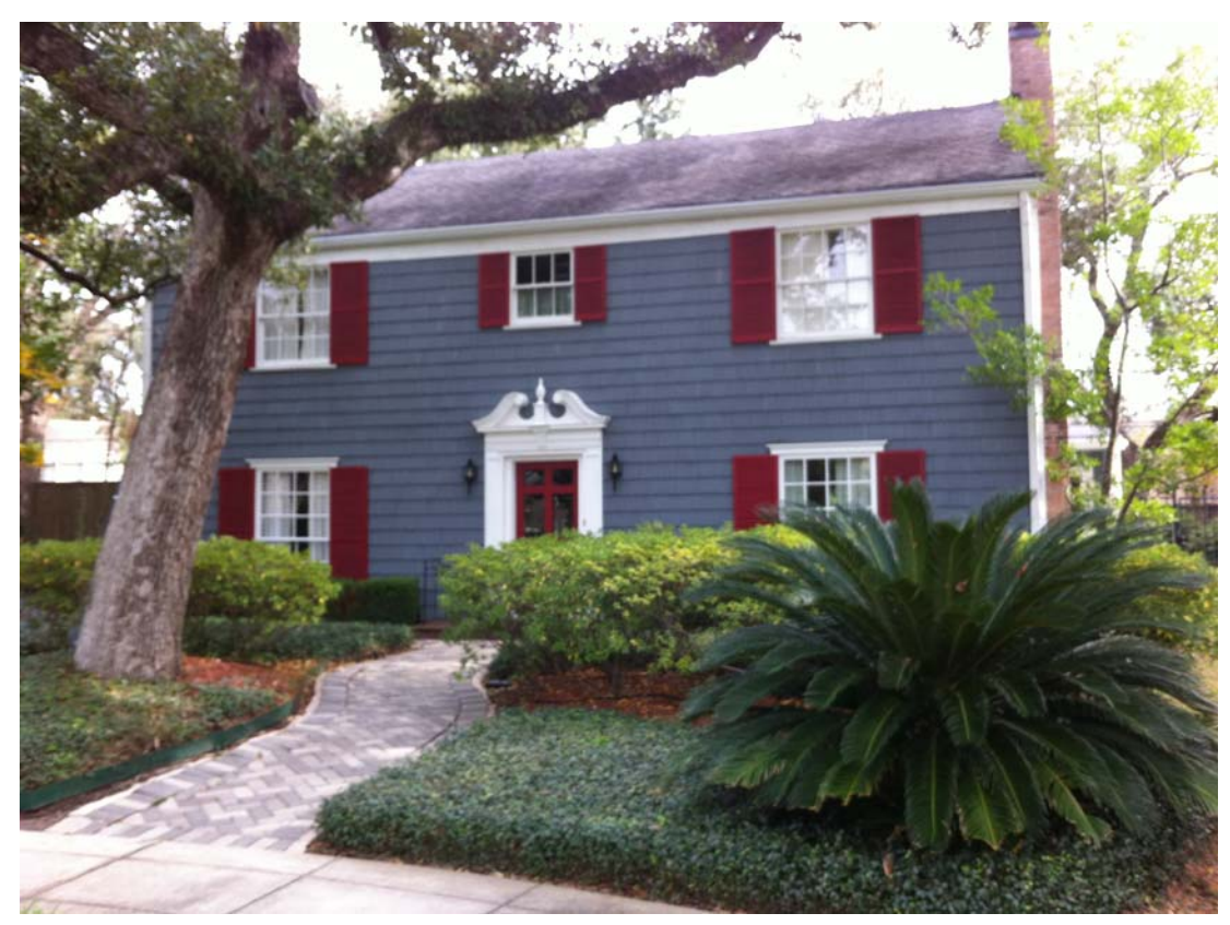
Ехнівіт А - Рното

Staff recommends that the Houston Archaeological and Historical Commission recommend to City Council the Landmark Designation of the Meldrum House at 2411 Stanmore Drive.