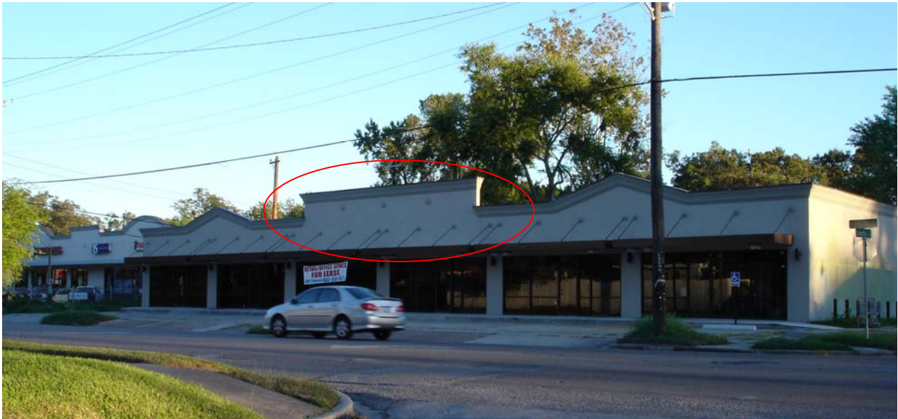
Photo of building at time of historic district inventory Not to Scale

SITE LOCATION: 502 E. 20 th Street – Houston Heights Historic District East