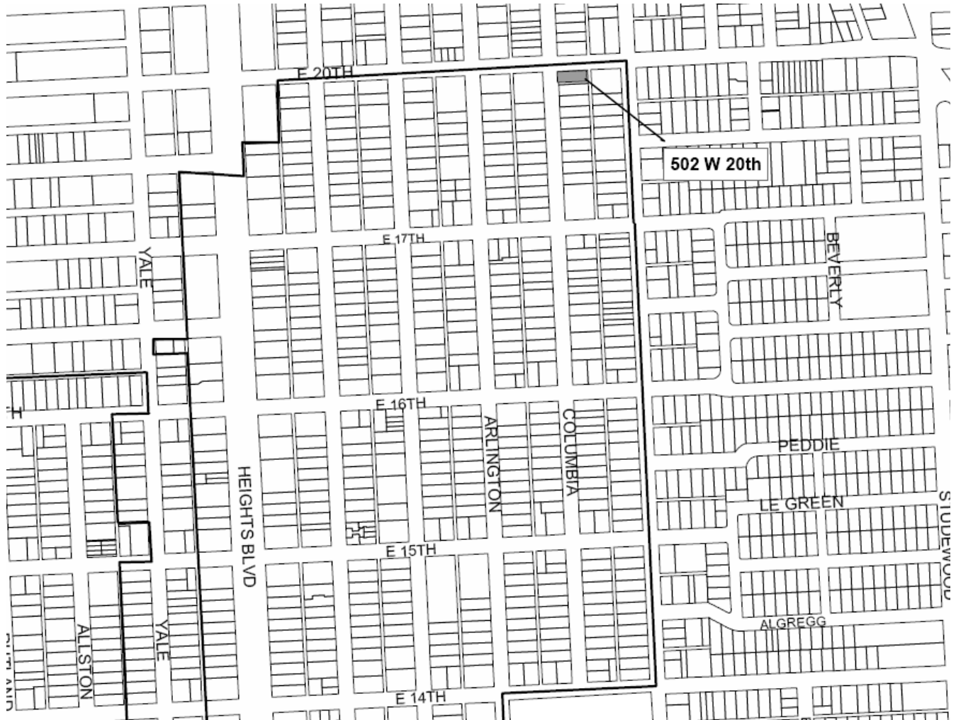
Site Location Map Not to scale

SITE LOCATION: 502 E. 20 th Street – Houston Heights Historic District East