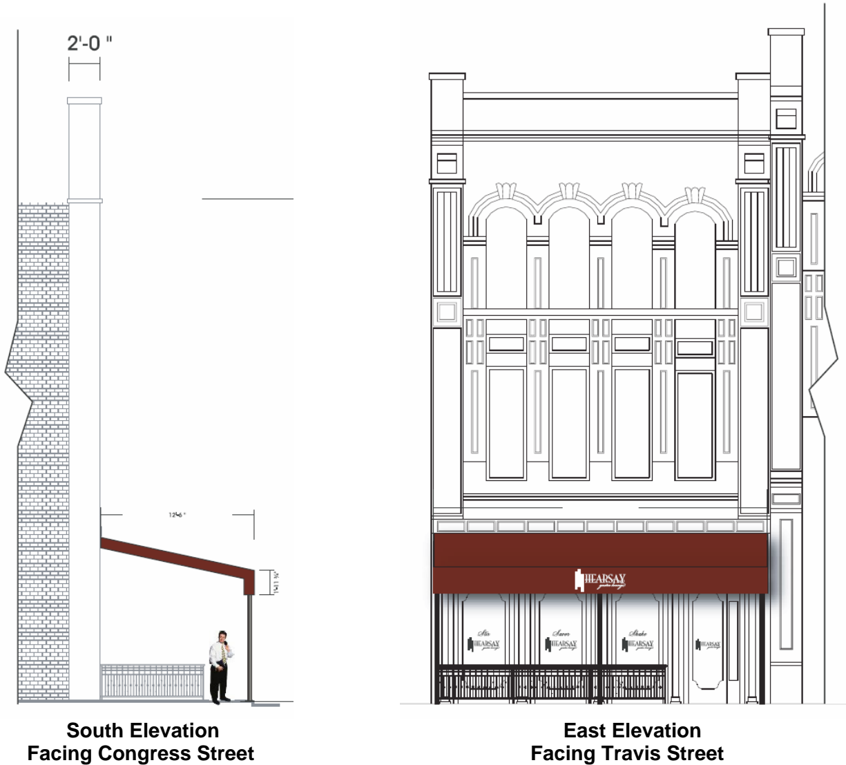
South Elevation Facing Congress Street