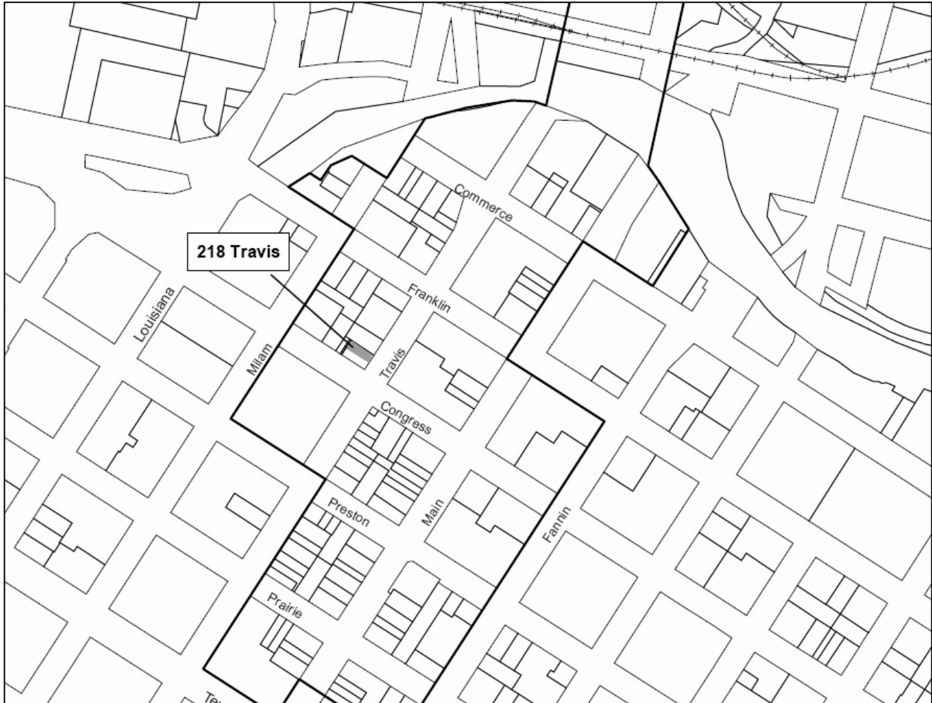
Site Location Map Not to Scale

SITE LOCATION: 218 Travis Street – Main Street/Market Square Historic District