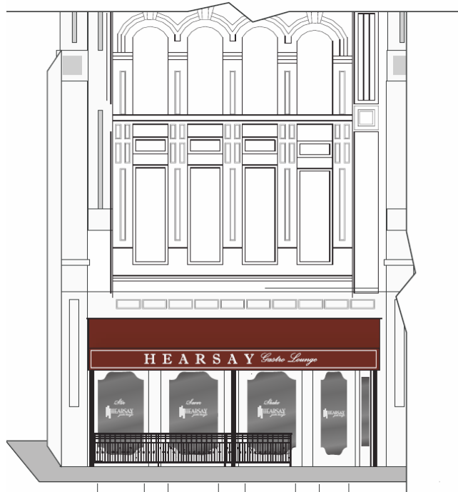
East Elevation Facing Travis Street