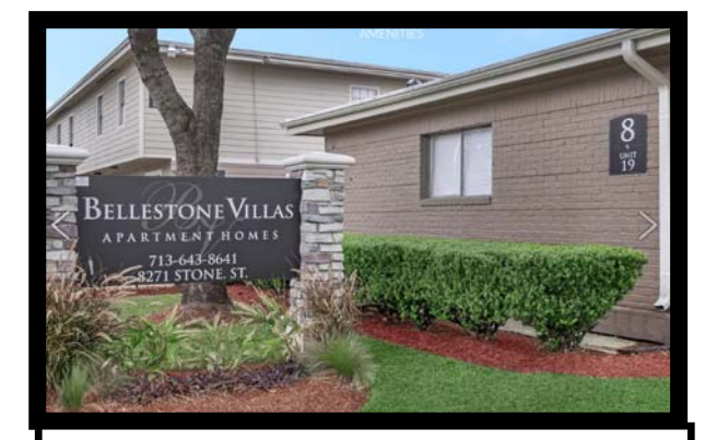
Bellestone Villas 8271 Stone