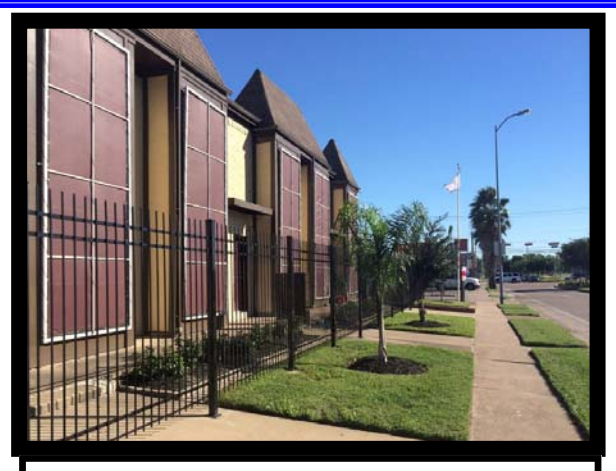
Spring Brook Lofts 3402 Blalock Manager's Name : Yvette Salazar