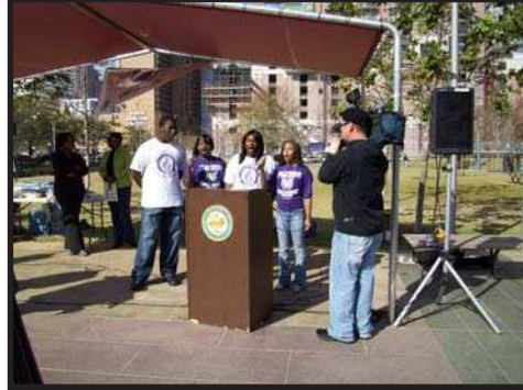
Phillis Wheatley High School Ensemble