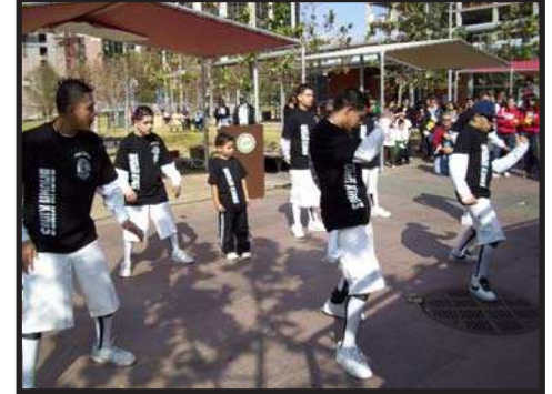
Brown Kings Breakdance Crew