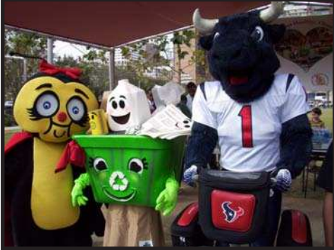
Lucky, Resurette, and Toro