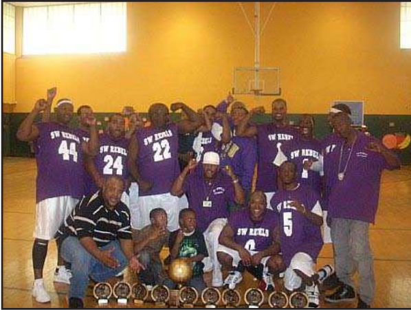
SW Rebels 2009 Solid Waste CMC Tournament Champions

One of my goals for the Public Information Section is to help provide you with the informational support you need to do your job. We will continue to educate the community through mail outs, flyers, door hangers, signs, press releases, radio announcements, our HTV show "Wasting No Time" and our website. The Public Information Office staff will partner with the SWMD's Community Outreach Division in attending civic club meetings to educate and answer questions about all of these new programs.