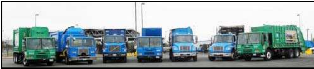
We want to congratulate all of our City of Houston winners:

The Texas Chapter of the Solid Waste Association of North America (TXSWANA) held its annual State Road-e-o in Beaumont, Texas on June 19th and 20th. The competition represented the best of the best drivers and mechanics from the State of Texas.