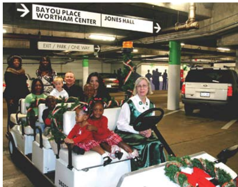
Holiday trams will shuttle theater-goers again this season.

The holiday season is upon us, with matinees of shows and other activities throughout the Theater District between now and January.