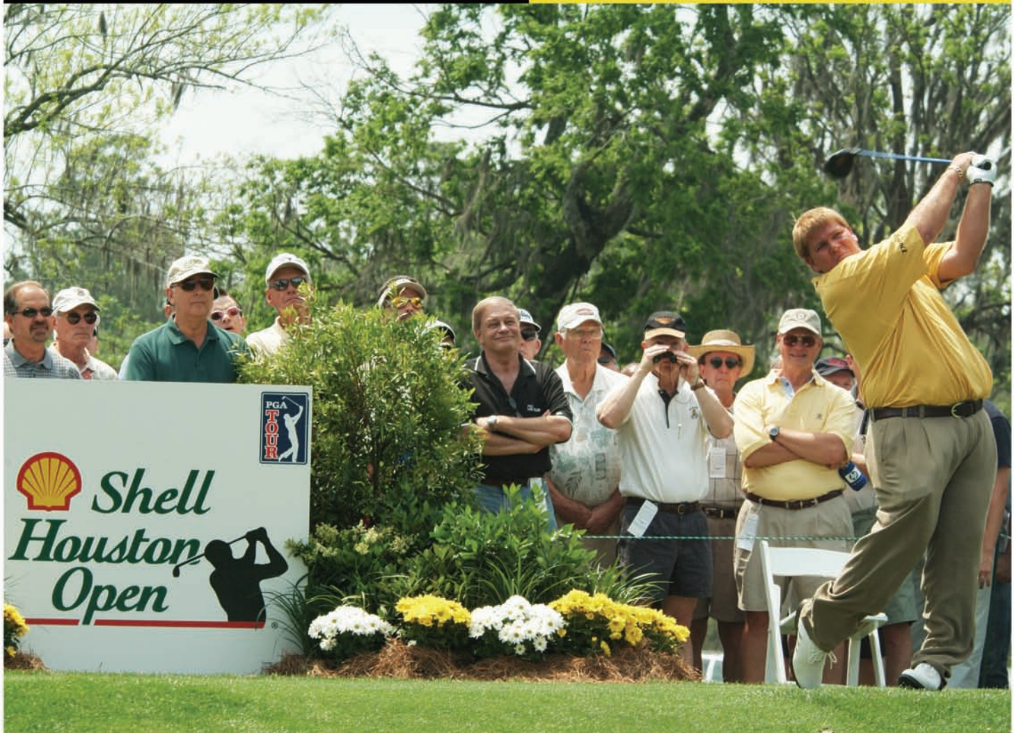
The Houston Golf Association has hosted PGA Tour events since 1946, making Houston's annual tournament the 10th oldest on the schedule.