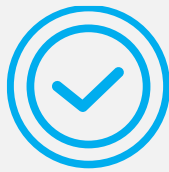
Compliance & Grant Administration