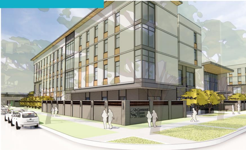
AERIAL PERSPECTIVE LOOKING SOUTH