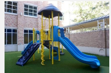
Infrastructure/ Neighborhood Services