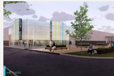
Community Economic Development