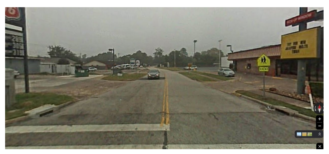
Walnut Bend Reconstruction - 2022