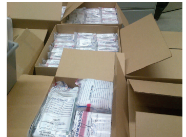
SAKs being packaged for shipping

Crime Lab have done an outstanding job in preparing for the outsourcing of all of these cases. Their diligence and dedication has been remarkable.