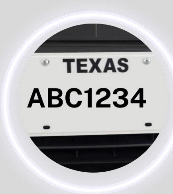
Handhelds and LPRs