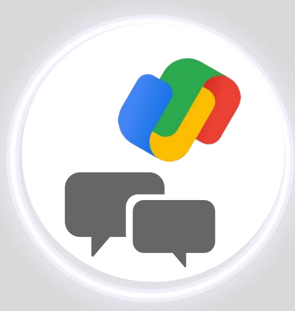
Digital Payment Methods