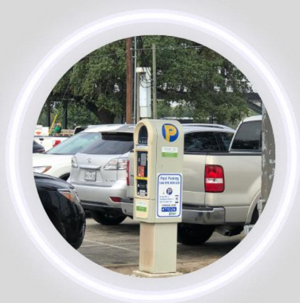
Solar-Powered Pay-by-Plate Meters