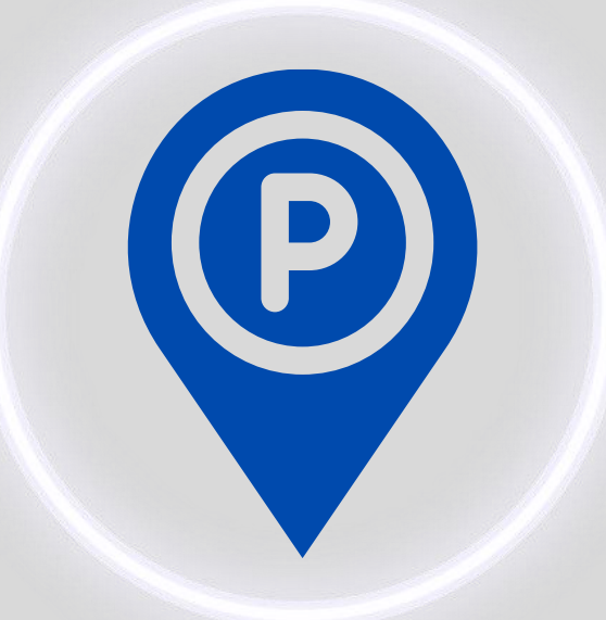
Curbside Parking Space Availability