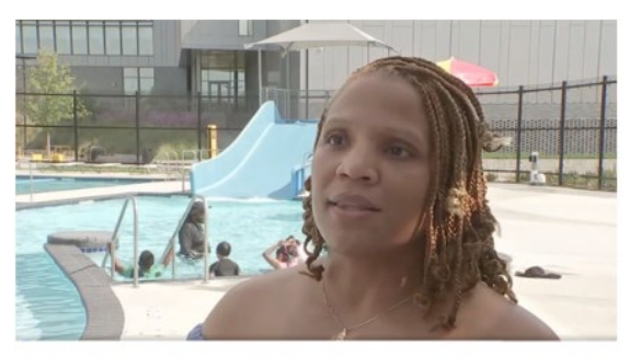
HOUSTON, Texas (KTRK) -- The day after two young children drowned in the San Jacinto River, free swimming lessons were offered at the new Alief Neighborhood Center.

State orders new environmental study of Houston low-income housing project