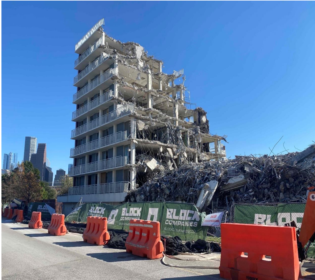
Demolition as of January 18, 2022

Demolition of core structure almost complete