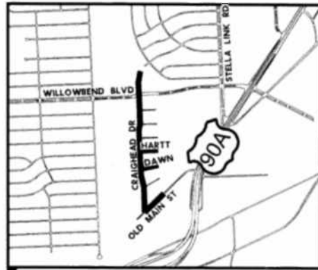
CAMBRIDGE PARK AREA 4 KEY MAP #532W & 572A COUNCIL DISTRICT: K COUNCIL MEMBER: LARRY GREEN