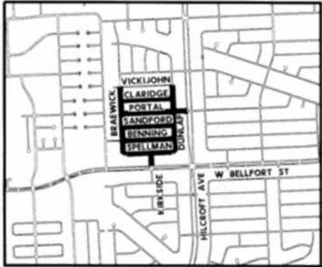
CAMBRIDGE PARK AREA 3 KEY MAP #530Z & 531W COUNCIL DISTRICT: K COUNCIL MEMBER: LARRY GREEN