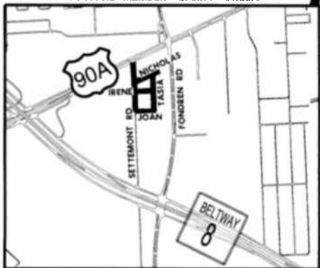
CAMBRIDGE PARK AREA 2 KEY MAP #570L COUNCIL DISTRICT: K COUNCIL MEMBER: LARRY GREEN