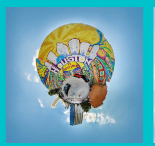
Houston is Inspired