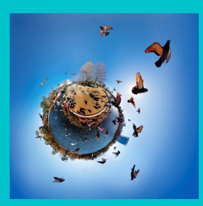
Hermann Park Pigeons