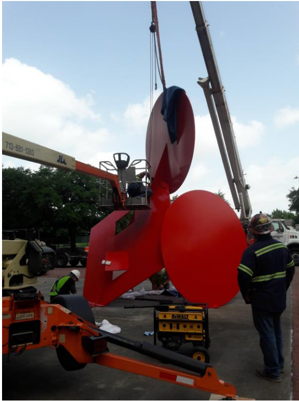
Conservation of Geometric Mouse, Scale X (Claes Oldenburg) at the Central Library. The sculpture returns to the site after being restored.