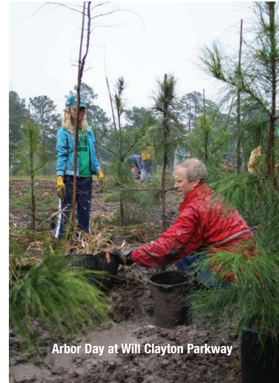
Arbor Day at Will Clayton Parkway