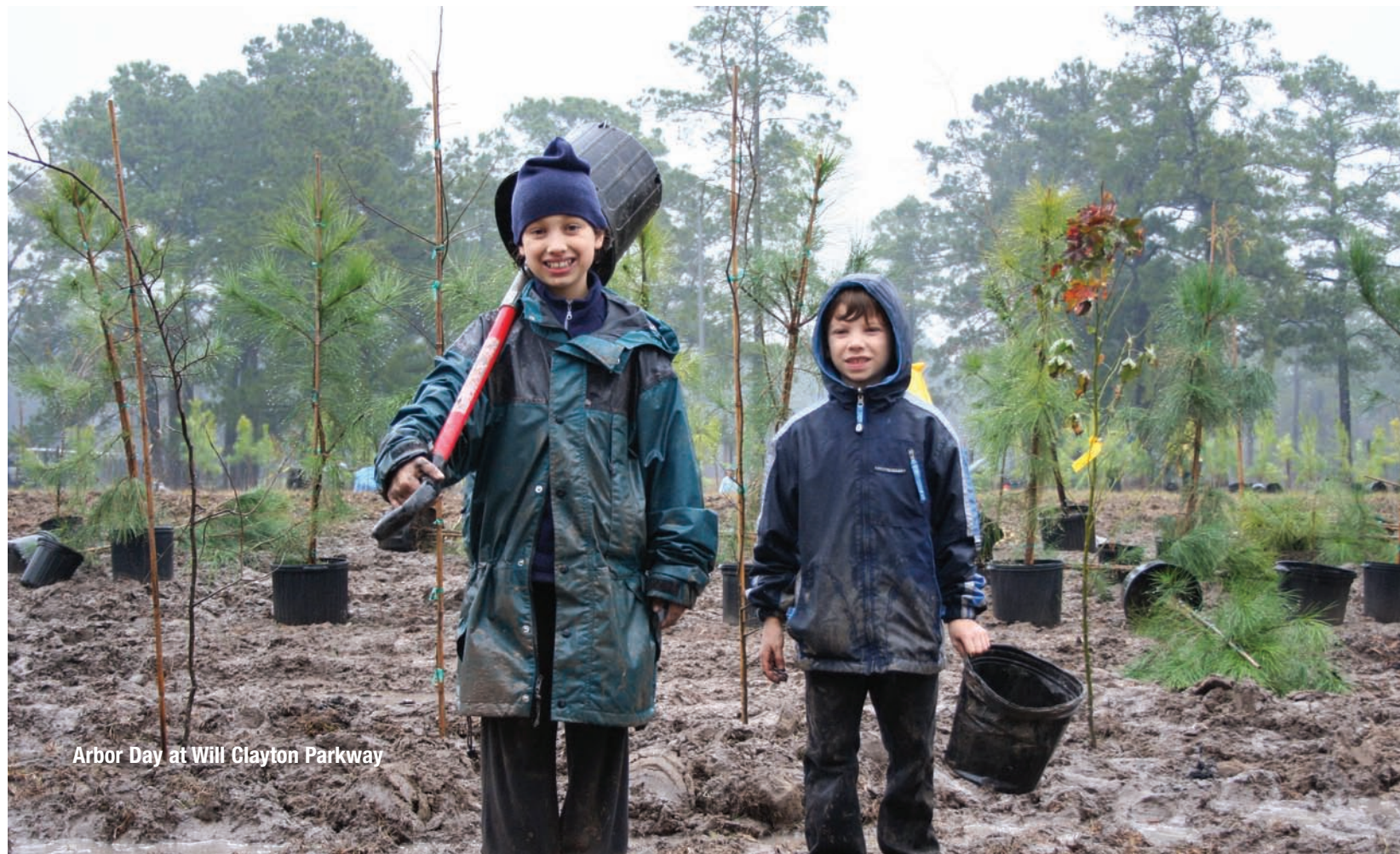
Arbor Day at Will Clayton Parkway