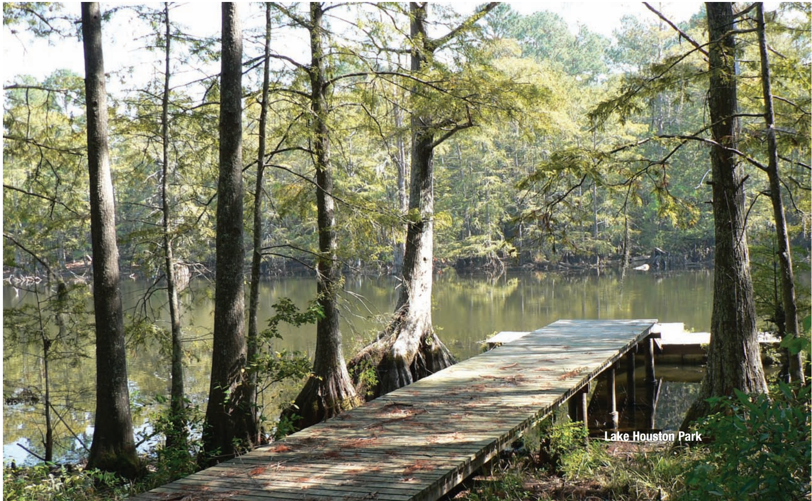
Lake Houston Park