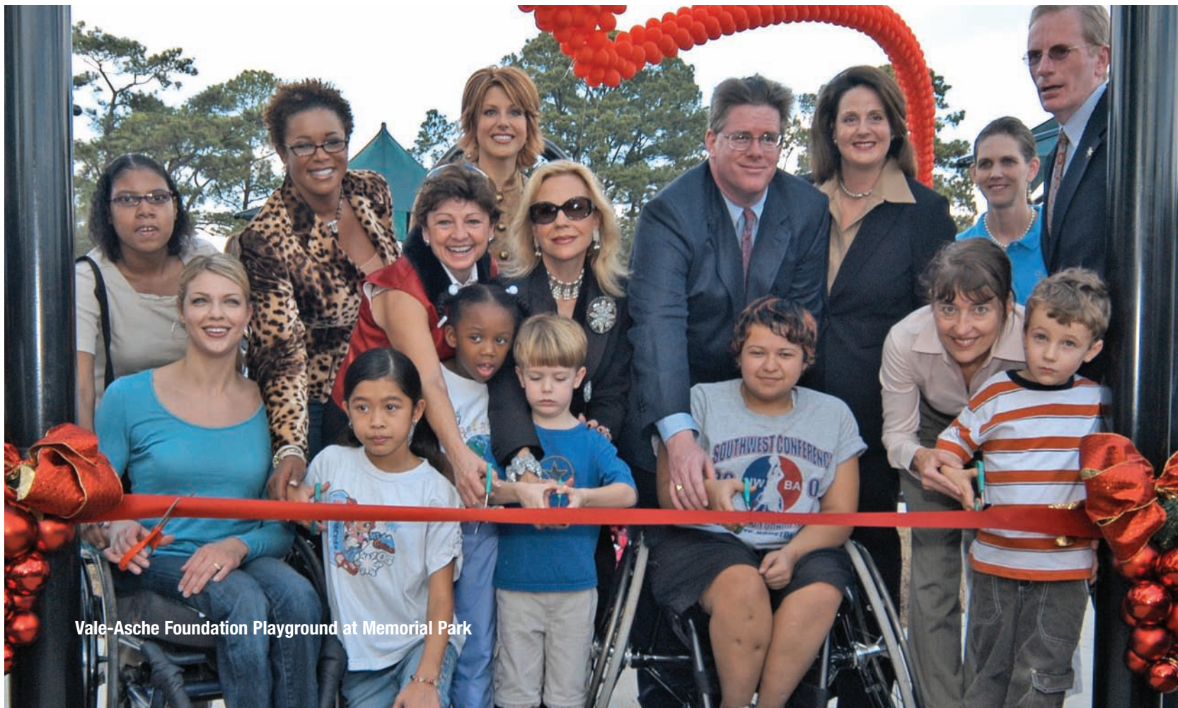
Vale-Asche Foundation Playground at Memorial Park