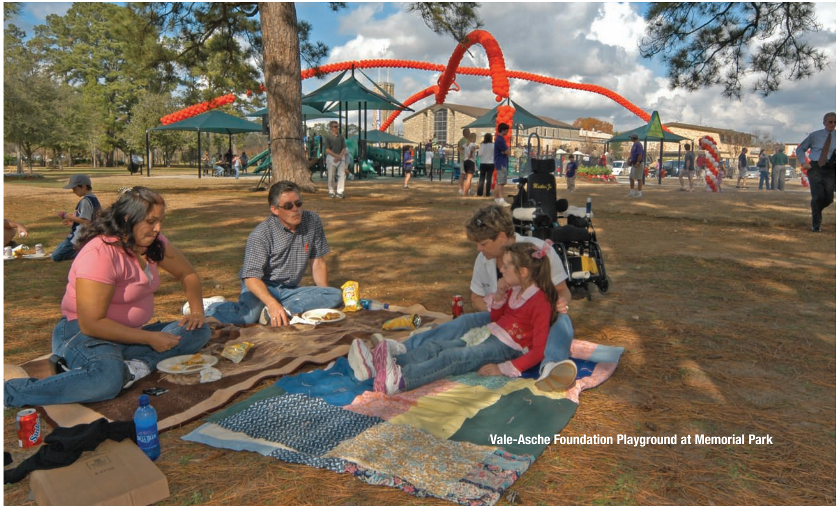
Vale-Asche Foundation Playground at Memorial Park