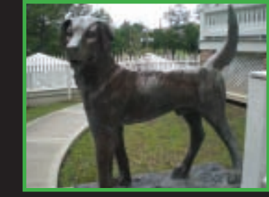
11. Pillot Dogs Richardson/Del Rey Bronze, Inc. - 1870/1989