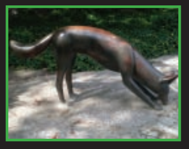
12. Neuhaus Fountain Coyotes Gwynn Murrill - 1992