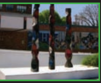
8. Fonde Totem Poles Untitled; artist unknown