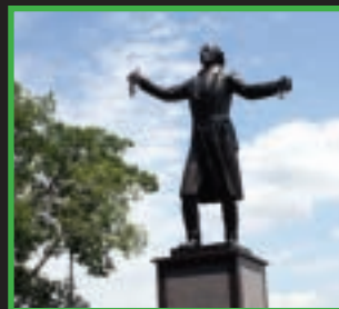
10. Hidalgo Park Don Miguel Hidalgo y Costilla Miguel Miramontes - 1991