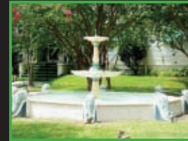
12. Hyde Park Hyde Park Fountain Artist Unknown - 1912