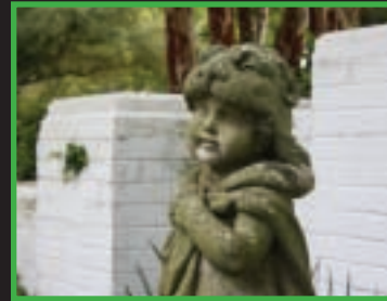
13. River Oaks Park Winter Artist Unknown