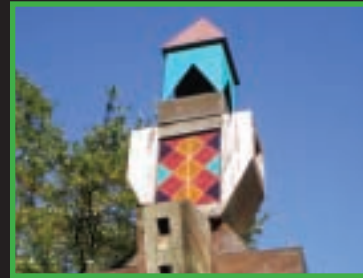
2. Fleming Park Fleming Park Totem Fletcher Mackey - 1991