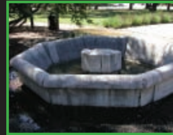
11. Baldwin Park Charlotte Allen Fountain Artist Unknown - 1912