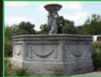
14. Sleepy Hollow Park Sleepy Hollow Fountain Artist Unknown - 1930