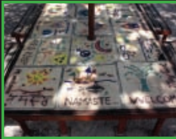
1. Burnett Bayland Park Bienvenidos A Nuestra Mesa Cathy Boswell - 1997