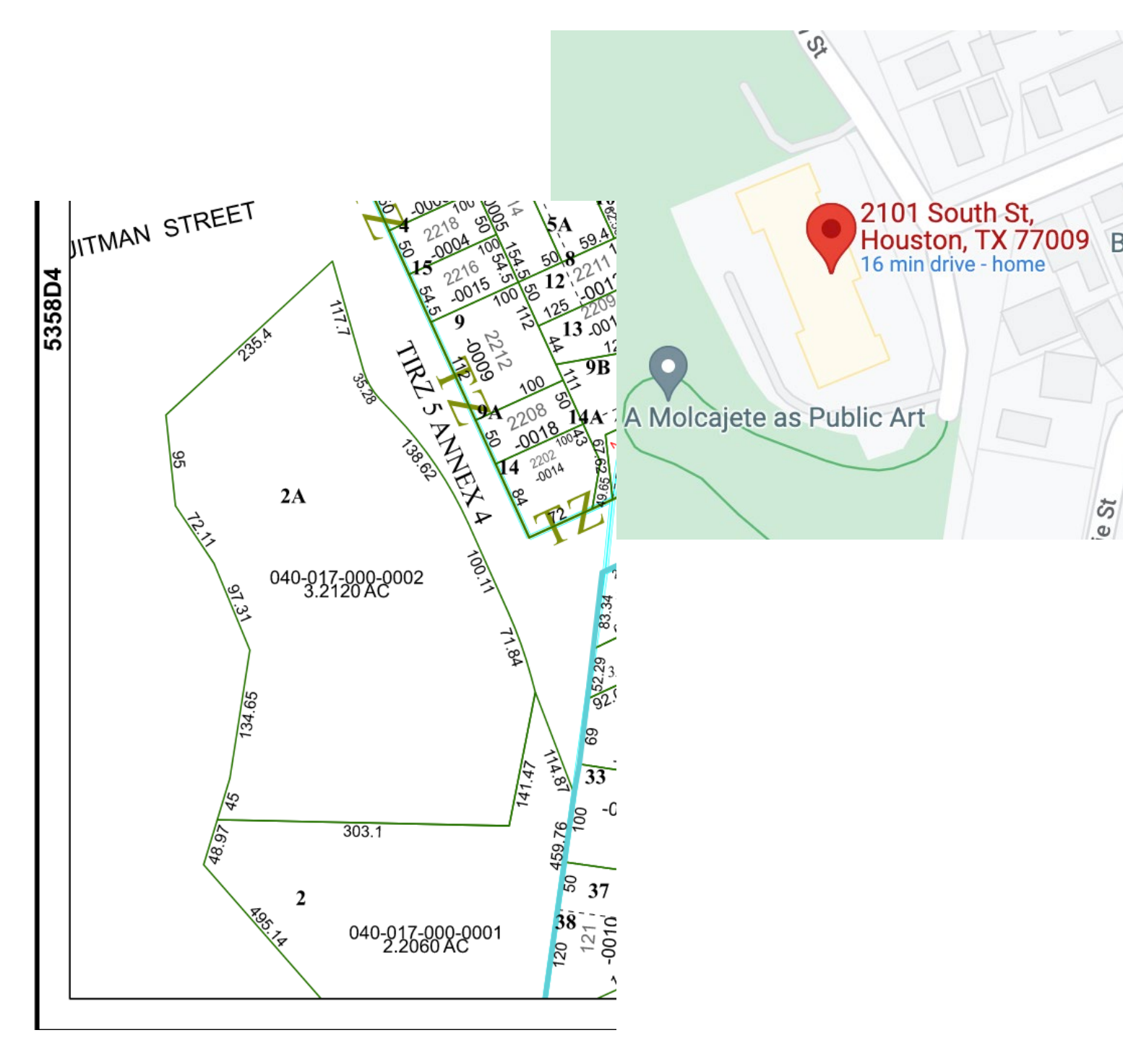
EXHIBIT B SITE MAP LEONEL J. CASTILLO COMMUNITY CENTER 2101 SOUTH STREET