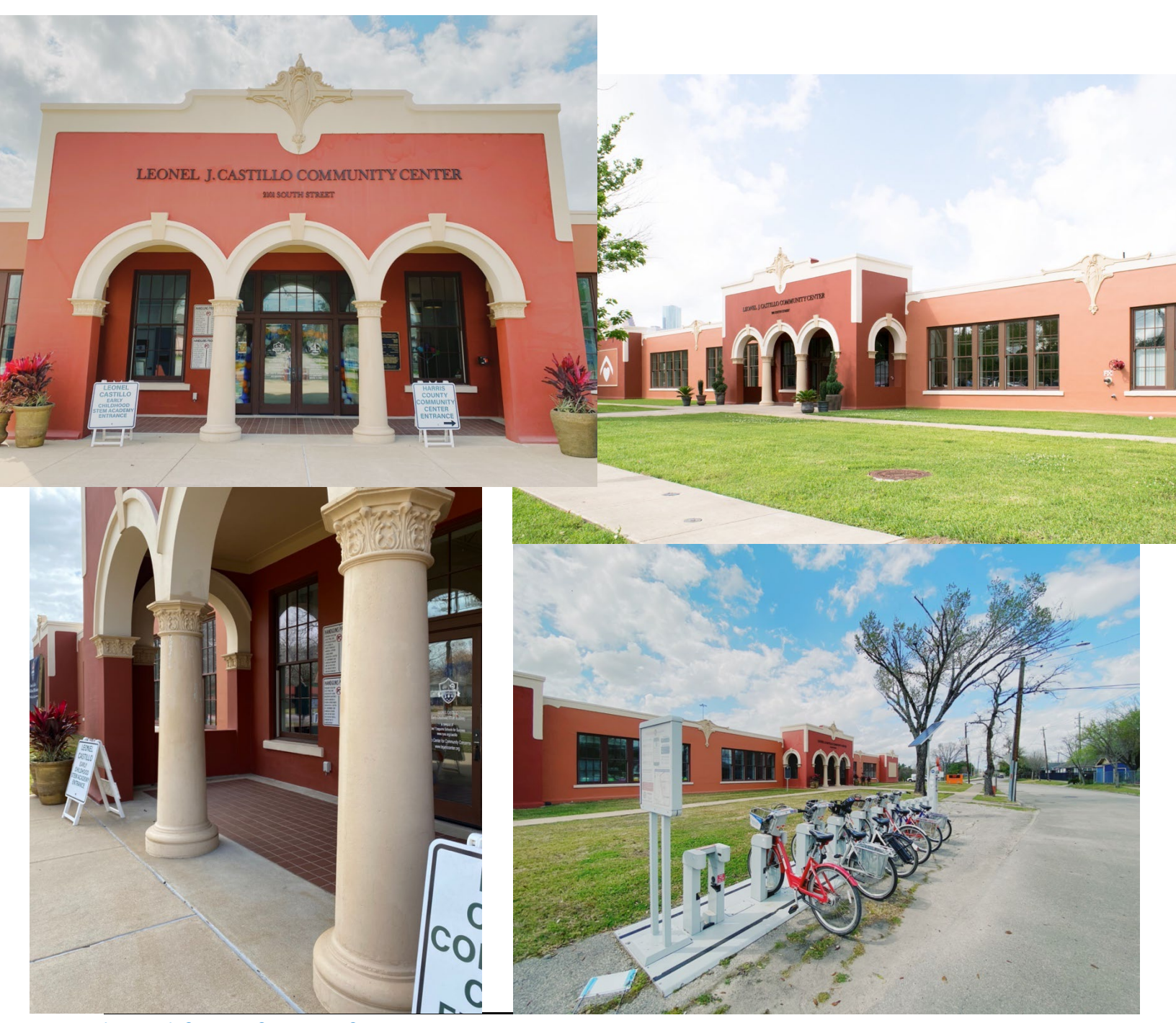
EXHIBIT A PHOTO LEONEL J. CASTILLO COMMUNITY CENTER 2101 SOUTH STREET