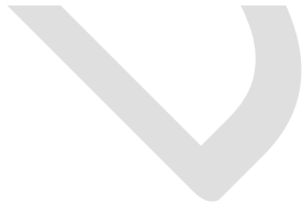
PROPOSED SIGNAGE SCALE PROPORTIONALLY

SPECIFICATION: ILLUMINATED REVERSE CHANNEL LETTERS