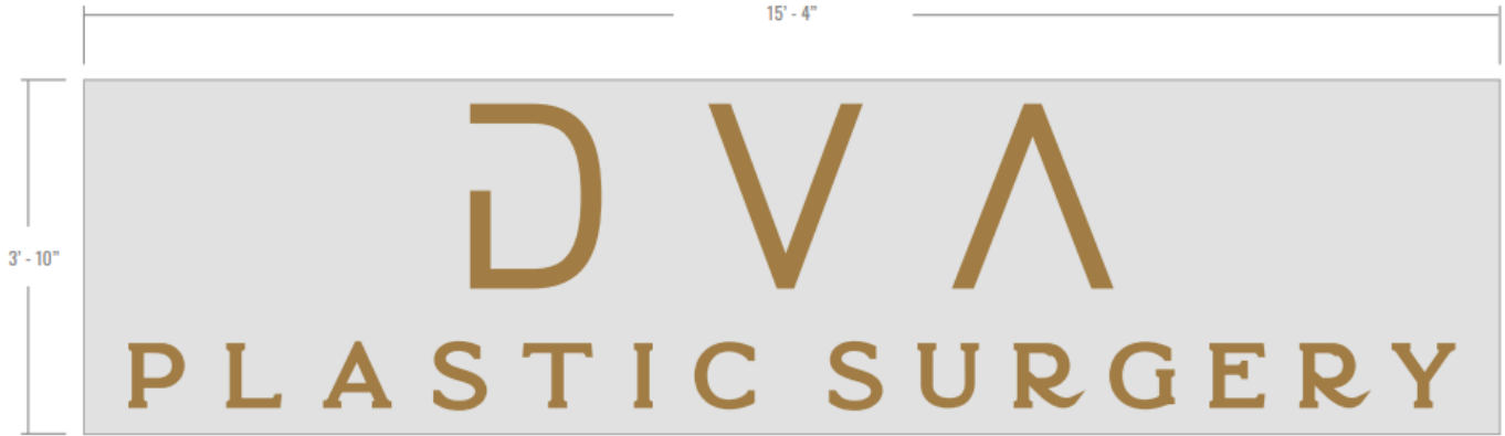
FRONT ELEVATION SCALE PROPORTIONALLY

Fabrication and install of a set of LED illuminated reverse channel letters