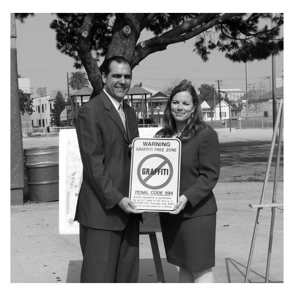
The Graffiti Free Zone spearheaded by safety partners in South Los Angeles helped to improve image, while signage designated the territory of community-oriented residents. Both are examples of 1<sup>st</sup> generation CPTED in action.