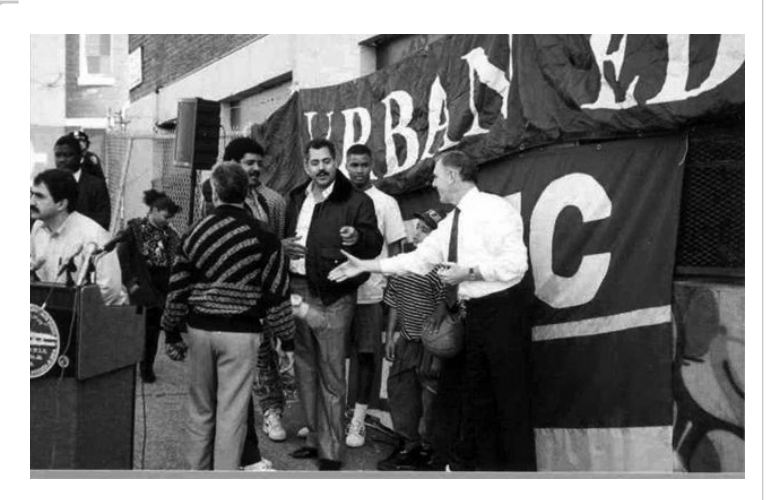
Urban Edge and its partners in the Boston Police Department have mobilized community residents, property managers and public officials to support comprehensive community safety strategies over the years.

Programs like these, while effective individually, are not an ideal way to circumscribe prevention and safety within the ecology of today's cities. The primary reason for this is these programs do not address the diverse ecological niches found within neighborhoods. For example, few (if any) of these programs teach residents how to organize themselves locally. Programs like these also make few attempts (or none) to coherently analyze neighborhood crime patterns and then tailor CPTED appropriately to respond to each pattern. Checklists certainly do not accomplish that. Furthermore, outside experts seldom provide local capacity to measure success in the long term. To offer long term, sustainable solutions, we need a more ecological and holistic approach to community safety and well-being.