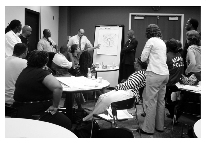
SafeGrowth practitioners in Miami, FL review design proposals for a public park and adjacent housing development in the neighborhoods of Overtown.

Occupying the back seat of the urban growth process is not new for crime prevention. Not that there haven't been valiant efforts from planners, community developers and police or security officers. In fact, the SafeGrowth strategy described in this article emerges from the lessons of successful crime reduction projects. Profiled in the following pages are community groups and police departments around the country who have come together in