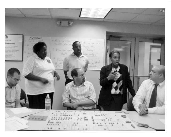
Focus: Hope leads a comprehensive SafeGrowth presentation focused on the reclamation of foreclosed properties in Detroit, MI

An effective SafeGrowth Plan offers an alternative to yearly crime summaries as a measure of neighborhood safety or annual police reports as a measure of police performance. Instead, this process provides step-by-step research and planning to form community safety plans and procedures. As many of our MetLife Foundation Award winners have shown, Safe-Growth best occurs through strong and informed neighborhood governance groups. These groups are often led by grass roots community organizations who partner with city agencies and police departments. SafeGrowth strategies vary in length and scope depending on the community assets and liabilities at hand. Sites across the country prove that strong partnerships lead to established programs – the basic goal of SafeGrowth – and they clearly lend themselves to this model. These sites offer effective strategies that can and should be replicated, and Safe-Growth provides the means to do that. In addition, there are many ways in which SafeGrowth can come to life in situations different than those presented here. This guide offers a description of CPTED principles, the foundations of the SafeGrowth model and how to use them, as well as a vision of implementation for community developers around the country.