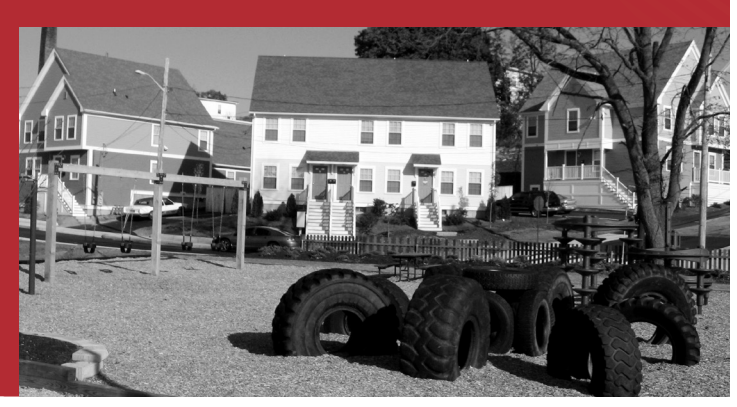
Community-police partners implement CPTED strategies in the redevelopment of Riverside Park in Providence, RI.

tion of new homes; and neighborhood residents felt that the whole area would be safer with access and travel along that portion of the park. Following the CPTED training, participants engaged in a focused lobbying campaign and convinced the City to reopen that portion of the street. These improvements, coupled with other partnership efforts, have resulted in a notable decrease in crime. The park is now an attractive recreational space used regularly by neighborhood residents and visitors.