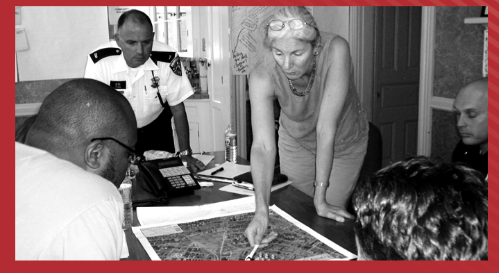
Community-Police Partners review neighborhood plans in Providence, RI