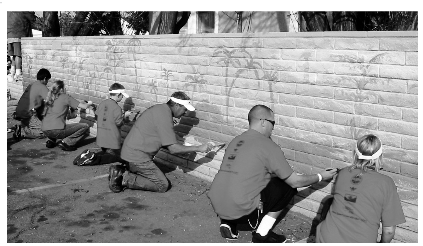
Artists and neighborhood volunteers apply 1st generation CPTED principles by painting murals in graffiti-prone locations in El Cajon, California to help promote a positive image for their community.

Since the 1980s, CPTED concepts have expanded considerably. There are dozens incorporated into advanced 1st Generation CPTED. One example is 'displacement', the idea that interventions merely moved a crime problem from one area to another. Criminological studies reveal that displacement is not inevitable and when it does happen there is often a net reduction in overall crime. Further, it is possible to displace certain activities in an attempt to minimize or avoid potential conflict between different groups using nearby spaces. This is known as intentional positive displacement. For example, moving a skateboard park away from senior housing could avoid tensions between conflicting user groups of a common space.