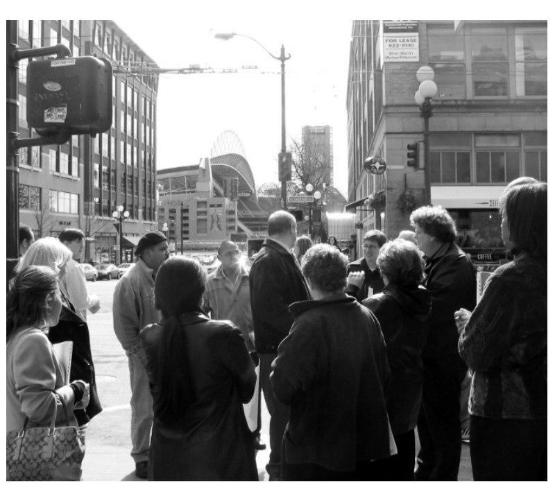
SafeGrowth planning groups composed of university, police and community representatives conduct safety audits in Seattle, WA.