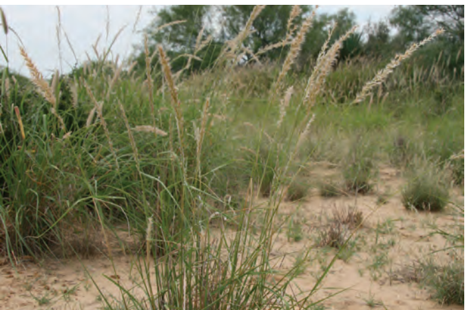
Seed heads of this bunchgrass is tinged with pink or purple