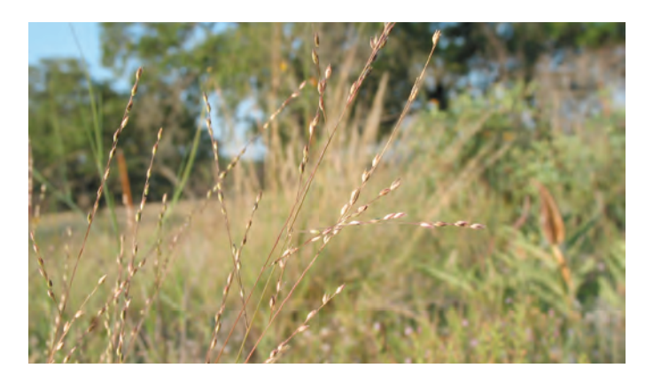
Hall's Panicum prefers dry, arid soils