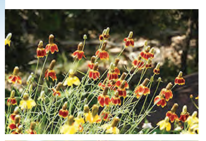
Foliage has a strong odor that repels deer.