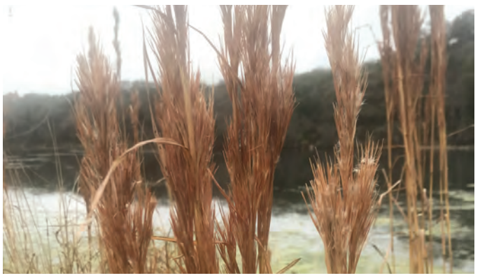
Bushy bluestem is a key species for wildlife