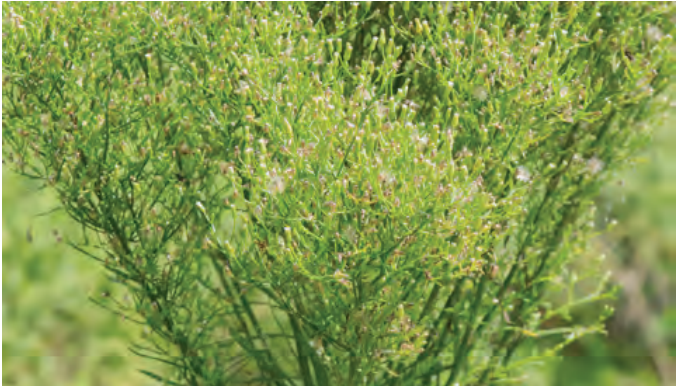
Horseweed is another member of the Aster family