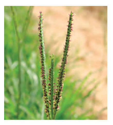
Bahiagrass has good salinity toxicity