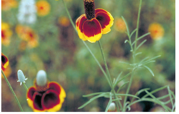
Tea from leaves and stalks used for stomach ache and pain in side