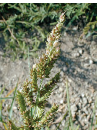
Barnyard Grass seed head