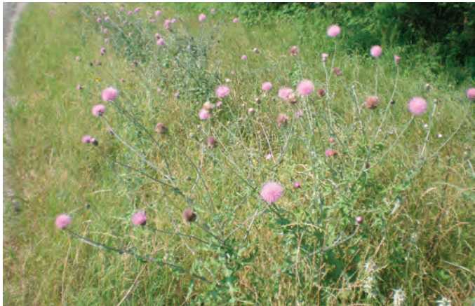
Texas Thistle is a native, pollinator friendly plant