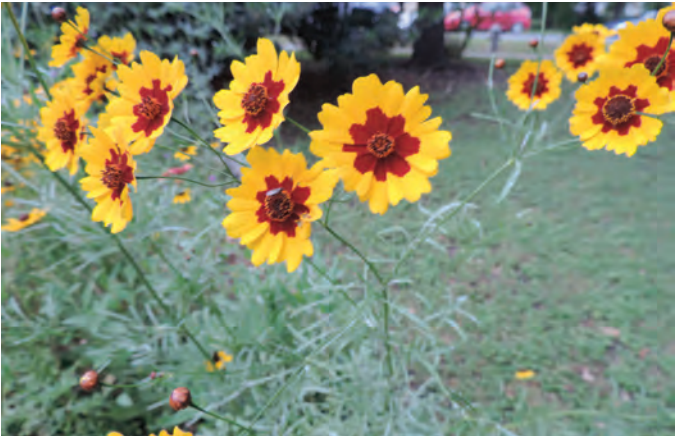
Plains coreopsis has historically been brewed as a tea