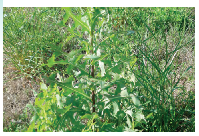
Prickly lettuce is commonly found in roadside ditches