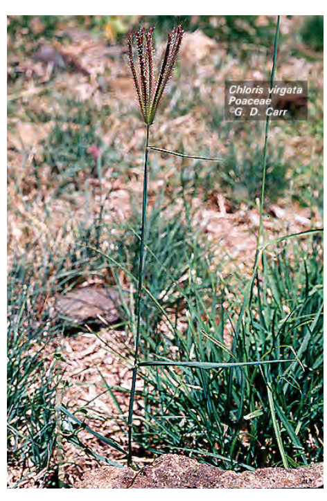
shows the Showy Chloris' seed head