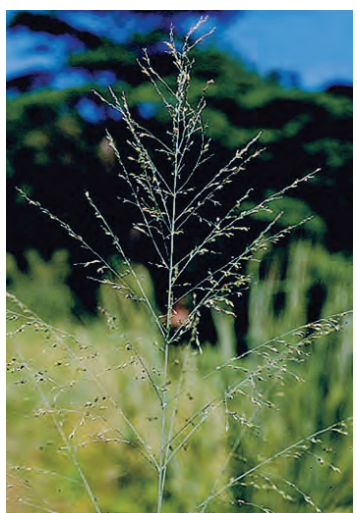
Mature Guineagrass seedhead