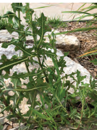
Like many invaders, Prickly Lettuce shades out desirable species