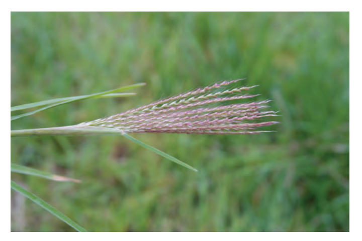
Tumble Windmillgrass seed head