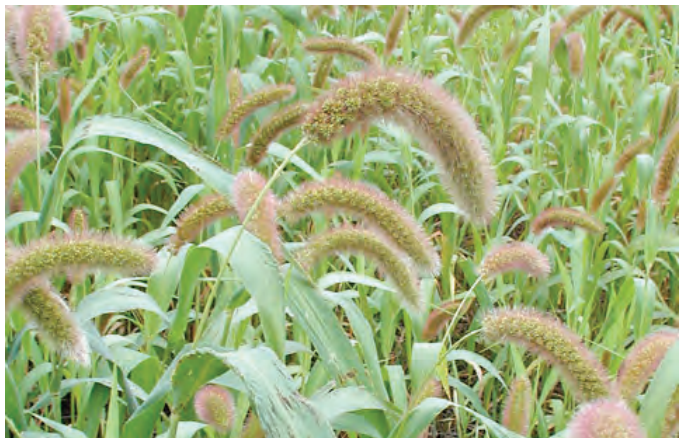
Foxtail Millet can provide a quick ground cover to hold and stabilize soil temporarily