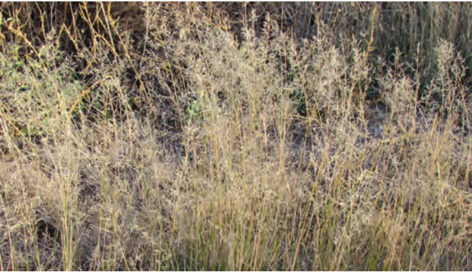
Lehmans Lovegrass establishes on disturbed soil quickly