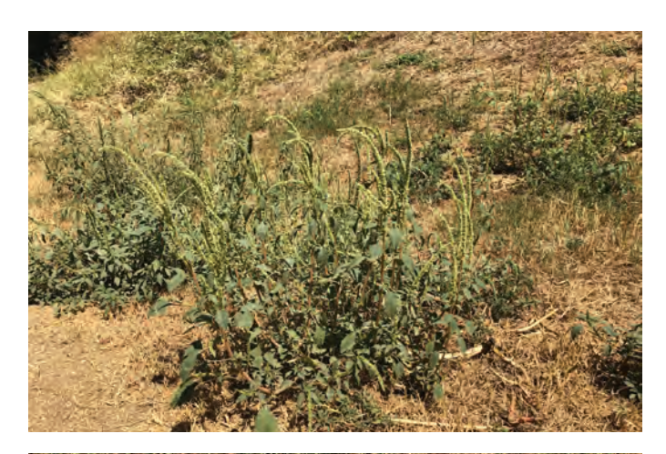
Pigweed is a common agricultural and roadside pest