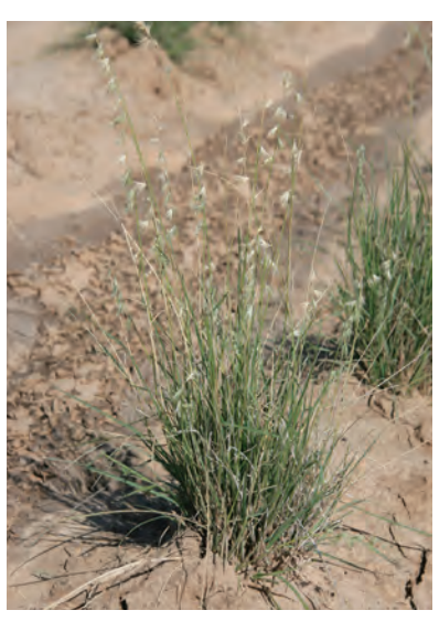
Texas Grama establishes well on disturbed soils