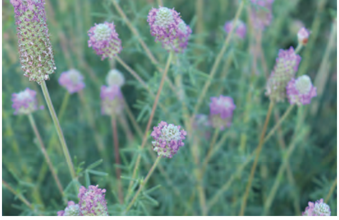
Purple Prairie Clover is most identified by its cylindrical flower.