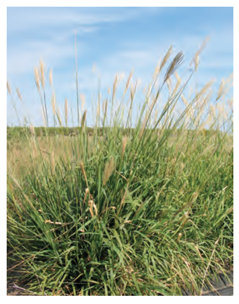
False Rhodes Grass is known for its showy inflorescence