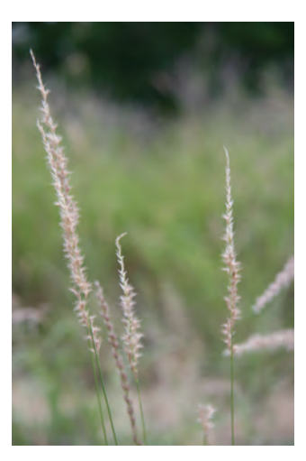
Pink Pappusgrass if found on sandy or gravely soils