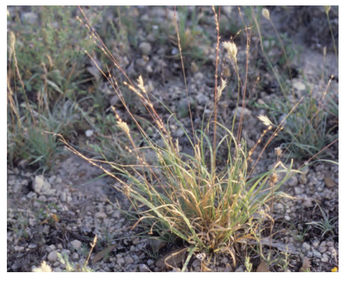
Hall's Panicum can be recognized by its dried, curling leaves