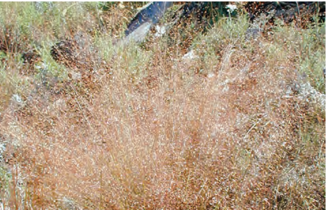
Bunch of Sand Lovegrass