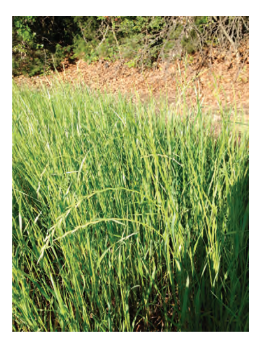
Annual Ryegrass is no longer used in seeding the ROW