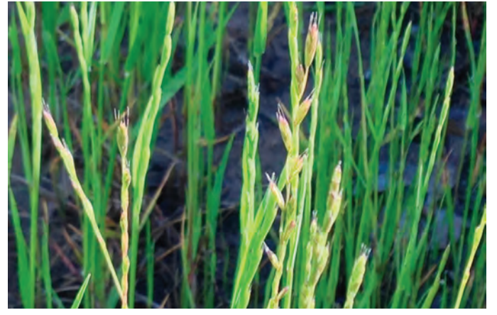
Annual Ryegrass seed heads

Photos courtesy of Amanda Fowler, TxDOT Maintenance Field Support Section.