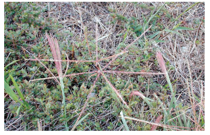
Windmill effect of the infloresence