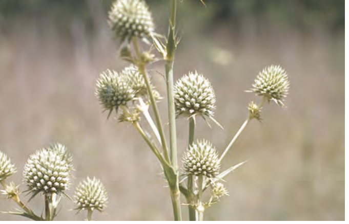
Their spiny leaves make them unpalatable to grazing livestock.