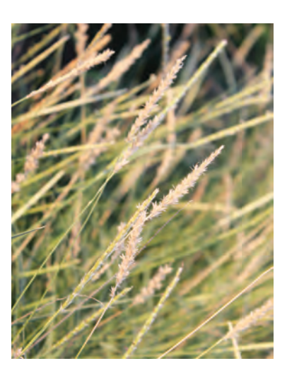
Galleta grass has historically been used for basketry and other items