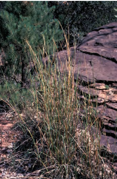
Photo courtesy of Randy Rosiere, Range Types of North America, Tarleton State University and show Sand Bluestem seed heads

Photo courtesy of James Bowns, Utah State University Extension, shows Sand Bluestem plant