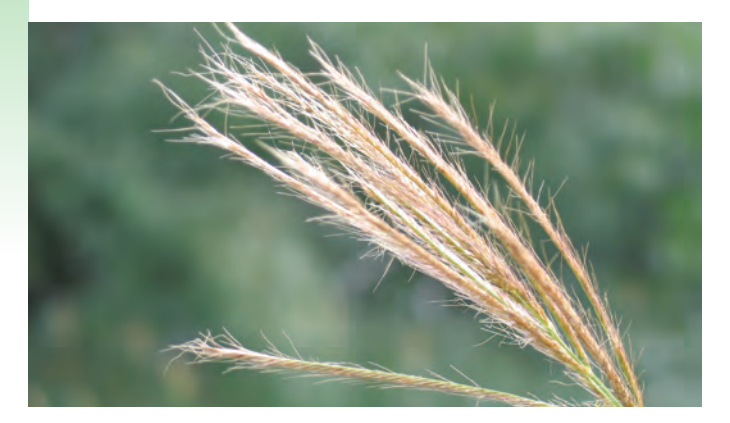
False Rhodes Grass prefers deep alluvial soils