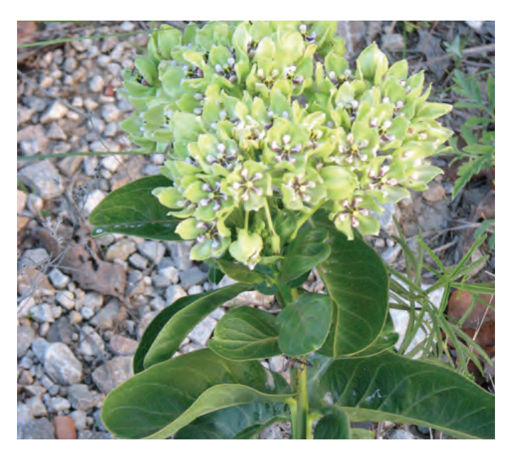
Green Milkweed is an important host plant for Monarch butterflies