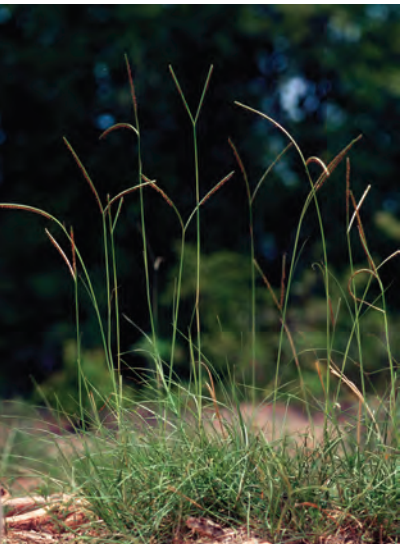
Bahiagrass is sometime the dominant species in East TX ROW's despite being an introduced species