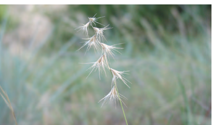
The seedhead of Texas Grama is bell shaped