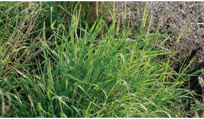
Plains bristlegrass may flower more than one time per year