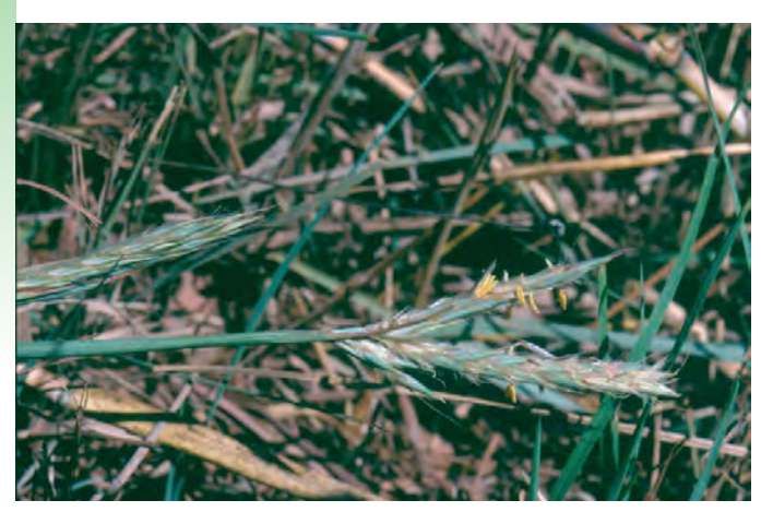
shows Sand Bluestem plant