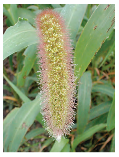
Bristly seed head of Foxtail Millet