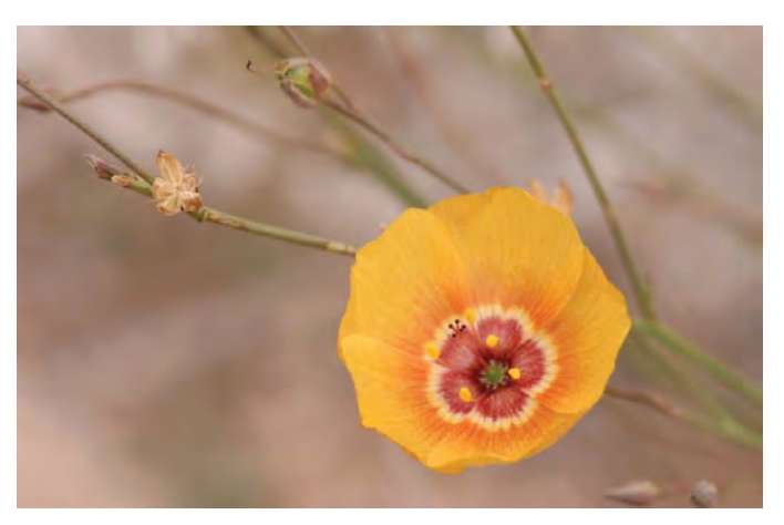
A close up of the Chihuahua Flax flower