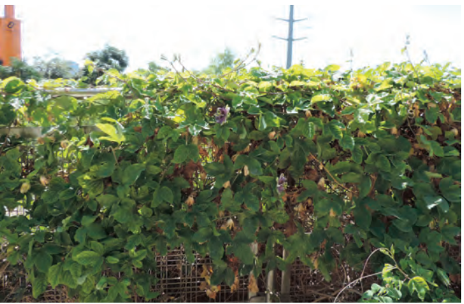
Passsionflower has many varieties and can be found in many areas of Texas and the US