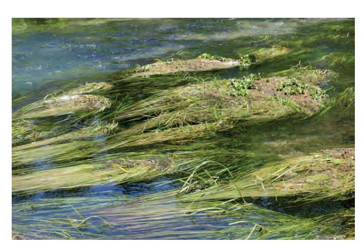
Texas Wild-Rice is an endemic species which grows in Texas Rivers