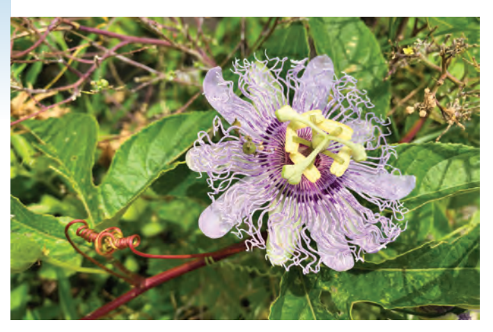
Passsionflower is a native vine loved by pollinators