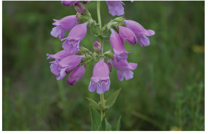
This plant is a strong attractor for moths