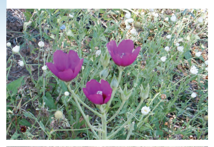
Texas Poppy-mallow prefers deep sandy soils