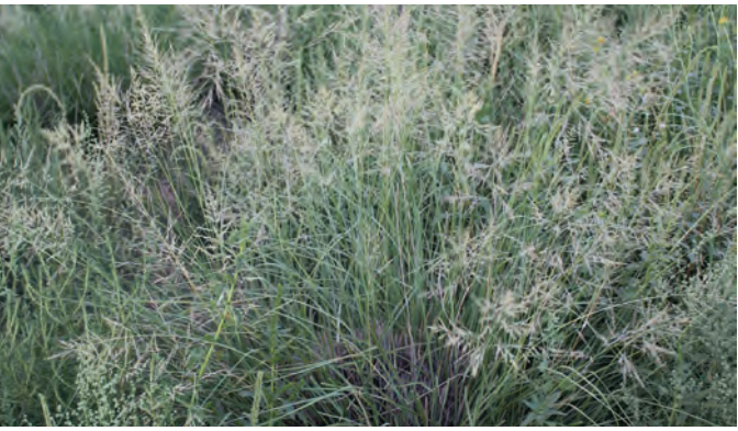
Alkali Sacaton is very tolerant of salt affected soils