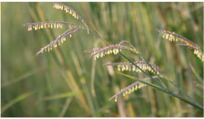
Big Bluestem is considered one of the major grasses of the tallgrass prairie