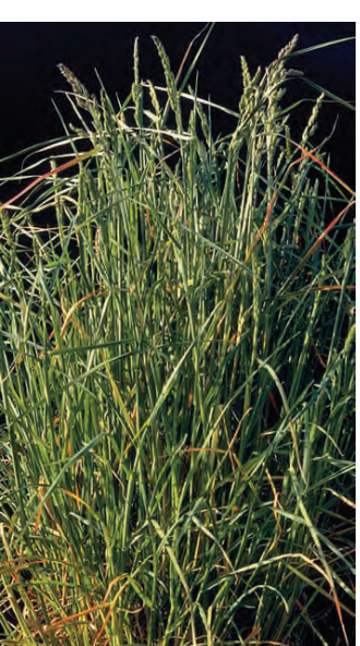
Orchardgrass was introduced from Eurasia and Africa