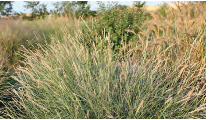
Galleta grass is an important grass in drier areas