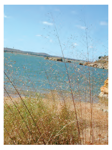
Delicate seed heads of Sand Lovegrass