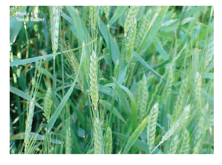
shows wheat inflorescence in a field.