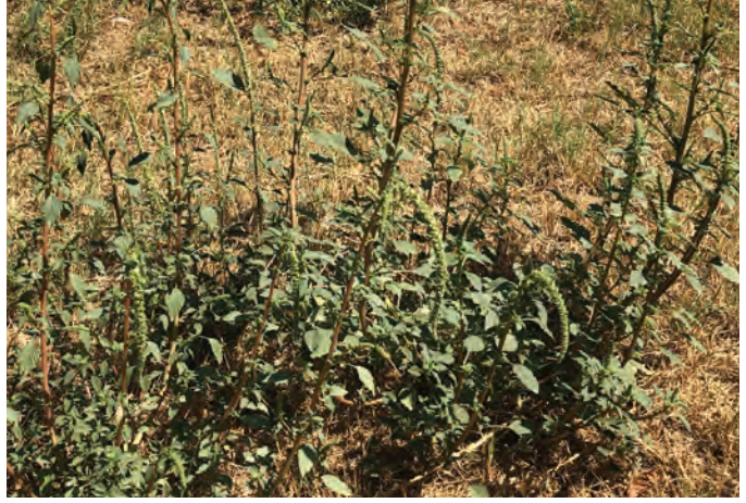
Pigweed is one of our hardest weeds to control.