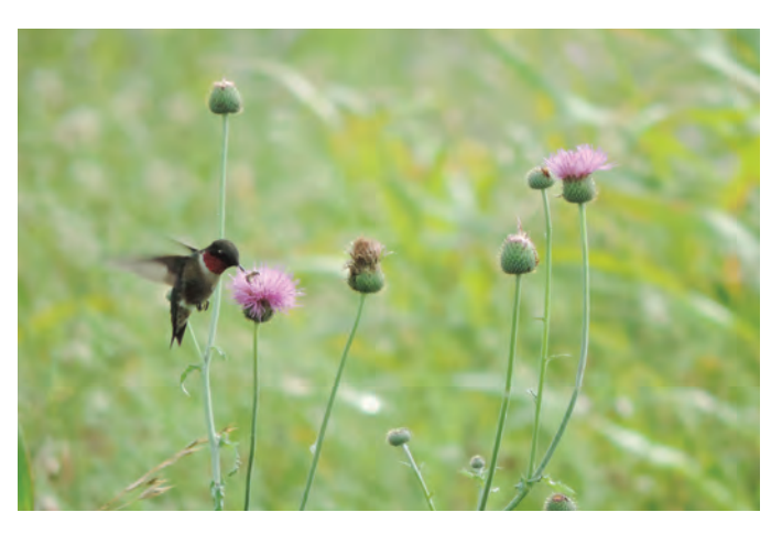
Texas Thistle is a popular plant for pollinators