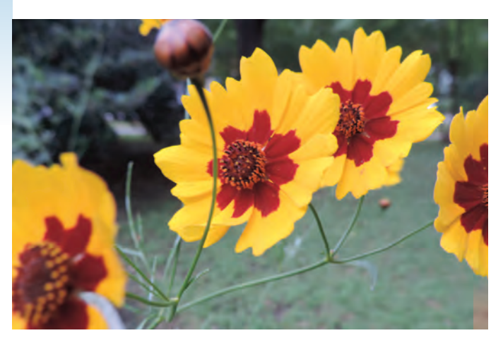
Plains coreopsis is cultivated extensively