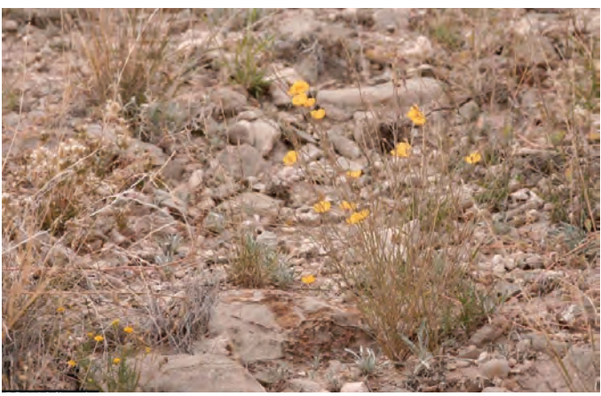
During rainy years in the desert Chihuahua Flax thrives and is abundant