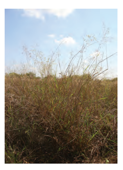
Lehman Lovegrass can be invasive