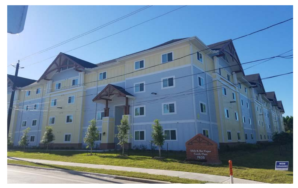
Adele & Ber Pieper Family Place