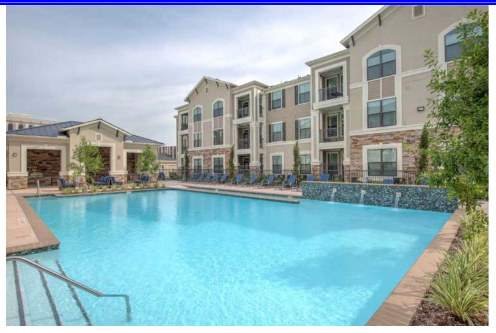
Lafayette Plaza Senior Living