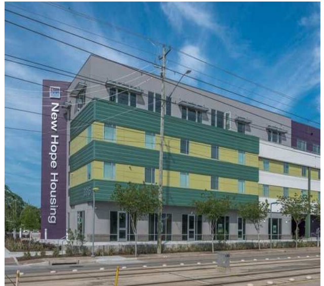
New Hope Housing at Harrisburg 3315 Harrisburg Houston, Texas 77003