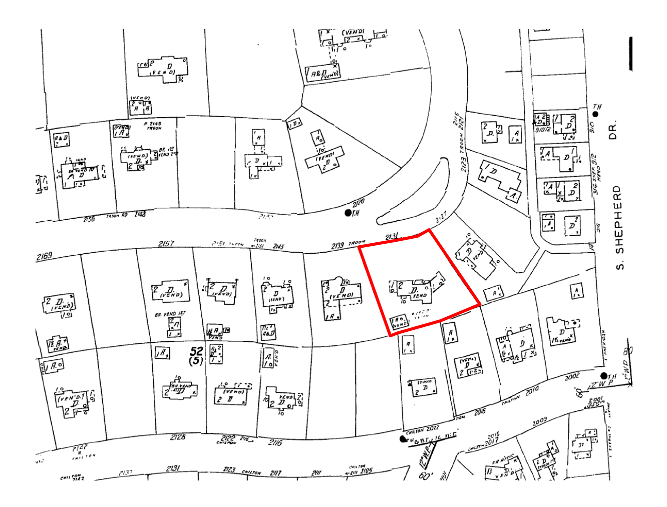
EXHIBIT D SANBORN MAP THE LANGDON-CUMMINGS HOUSE 2131 TROON ROAD