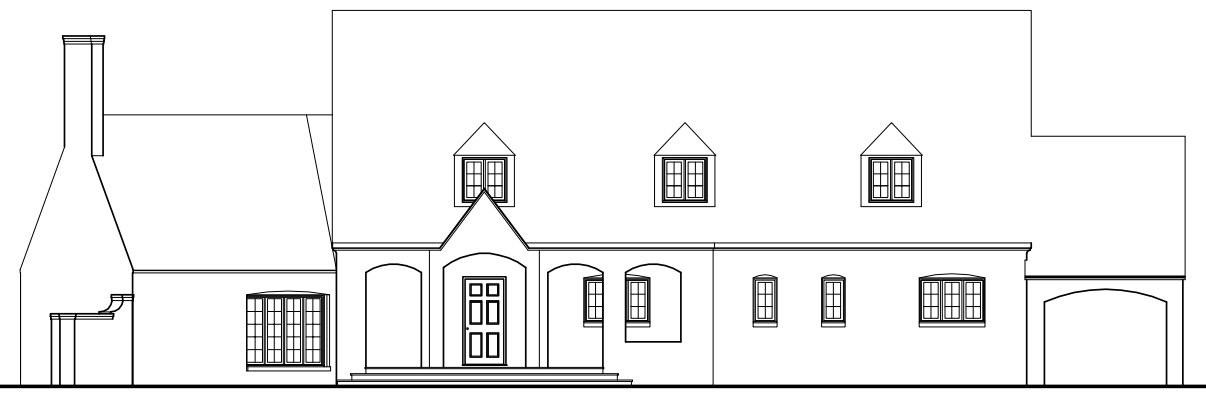
North Elevation - BEFORE