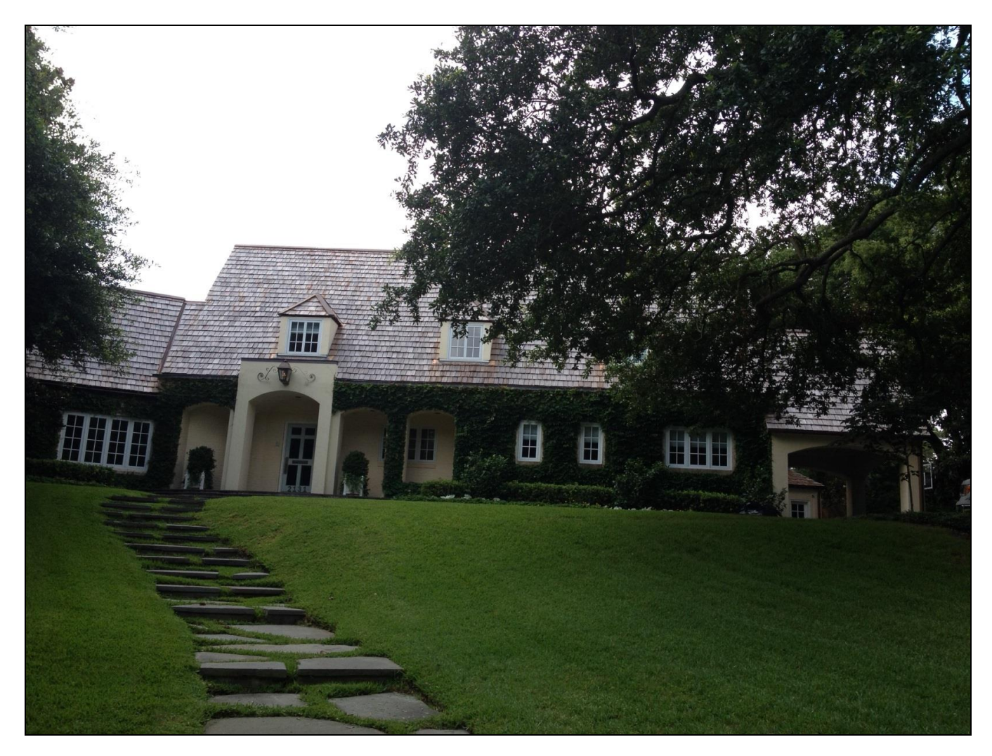
EXHIBIT A PHOTOS THE LANGDON-CUMMINGS HOUSE 2131 TROON ROAD