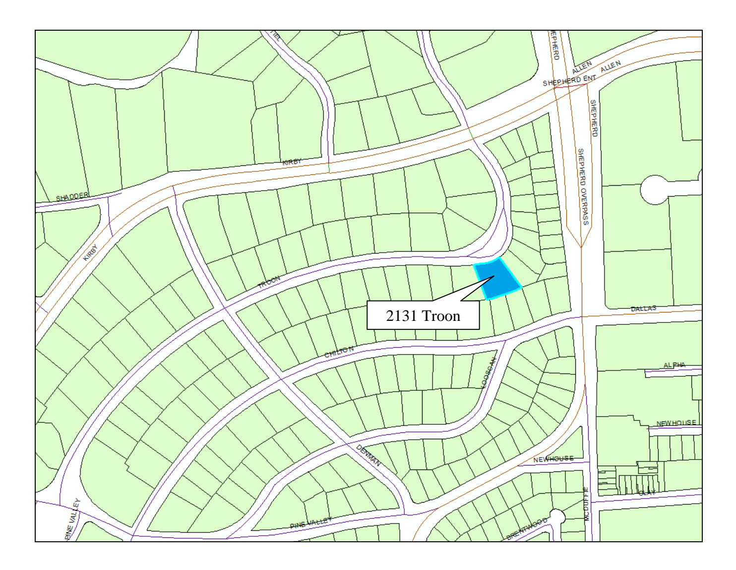
EXHIBIT B SITE MAP THE LANGDON-CUMMINGS HOUSE 2131 TROON ROAD