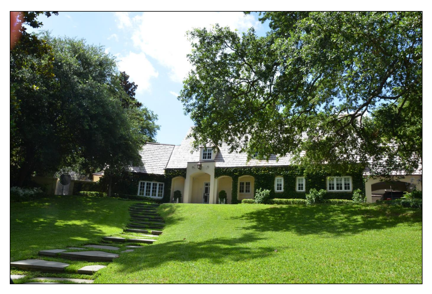
EXHIBIT A PHOTOS THE LANGDON-CUMMINGS HOUSE 2131 TROON ROAD